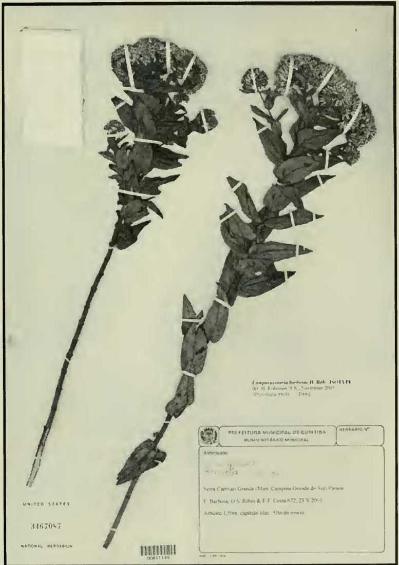
Fig. 2. Campovassouria barbosae H. Robinson, isotype, United States National Herbarium (US).